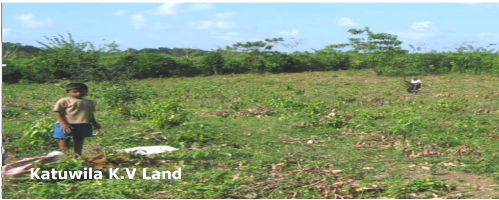
Katuwila K.V Land