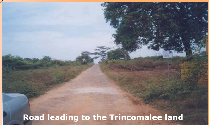
Road leading to the Trincomalee land

Your ideas towards this worthy cause is indeed valued and appreciated. Please feel free to communicate your thoughts, suggestions and creative ideas to us by email to info@aitkenspence.lk or by Fax on 2307592 .